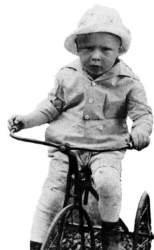
A certain Deacon aged four—guess who! Note those fancy wheels! See next issue.

At the present time there are about one-hundred-eighty in Sabbath attendance at Grand Rapids. This is a foundation upon which God can build a larger church after stability has been achieved.