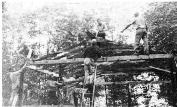
Elkhart-Grand Rapids members discuss knotty construction problem.

The two Elkhart Spokesman Clubs (sponsors), went "ALL-OUT" to make the occasion a gainful one—beginning with a "Camp-OUT" Saturday night, followed Sunday by a "Cook-OUT", a "Work-OUT", and a "Speak-OUT" (evening Spokesman's meeting). P.S. No "Drop-OUTS", but many lads of all ages reported home "Played-OUT"!