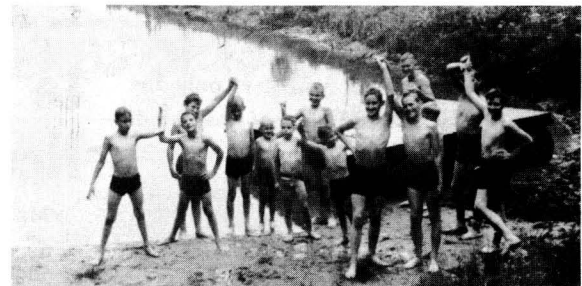
Meanwhile, boys are assigned in a "buddy system" prior to swimming.

Holland site to various points about the state, Grand Rapids included. Their "stamp" was imprinted upon every city they entered. They would go to their church two or three times on Sunday. This was indeed a pious people, believing they were God's elect and all others were lost.