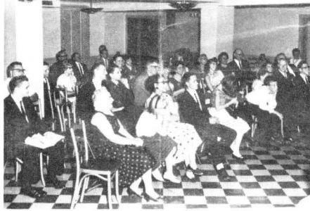
The Guest section at the recent Saturday night Spokesman Club Auction Night typifies the many Church functions in which brethren came out to take an active part. Many had much more fun just watching than bidding.

This auction was only one of the many activities sponsored by the Spokesman Clubs lately. We eagerly look forward to more fun-filled, exciting activities such as these. Why don't you join us?